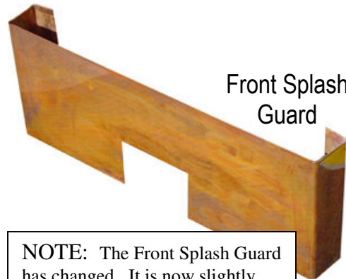
Front Splash Guard

NOTE: The Front Splash Guard has changed. It is now slightly narrower and has no notch. See Section 7 for instructions.